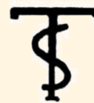
San Gabriel Mission Cattle Brand