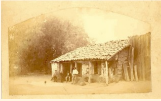
In the Mission Grove