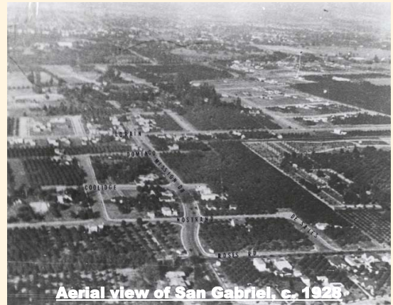
Aerial view of San Gabriel, c. 1928